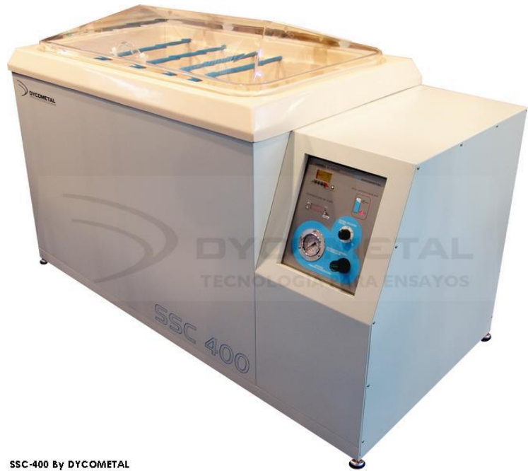
SSC-400 By DYCOMETAL

The Salt Spray Corrosion Test consists of an accelerated corrosion attack by an artificial salt spray of a certain composition, in the exact conditions of temperature and pressure.